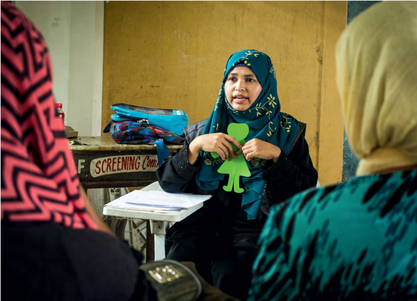
A community facilitator from Al-Mujadilah Development Foundation (AMDF) conducts a debriefing session with women as part of the family conversation sessions in Marawi

the tools for easing conflict so that they may “replicate the efforts in their own community”.