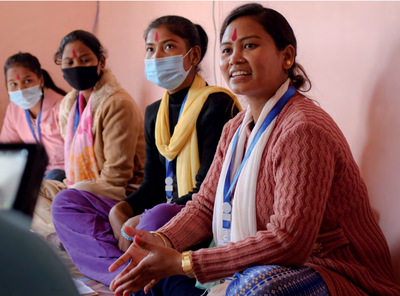
Women taking part in the 'Building Leadership for Women, Peace, Security, and Equity' programme run by Nagarik Aawaz, Nepal

the prospect of women leading villages. As one trainer explained: "You can't have women leading villages if the residents don't accept them."