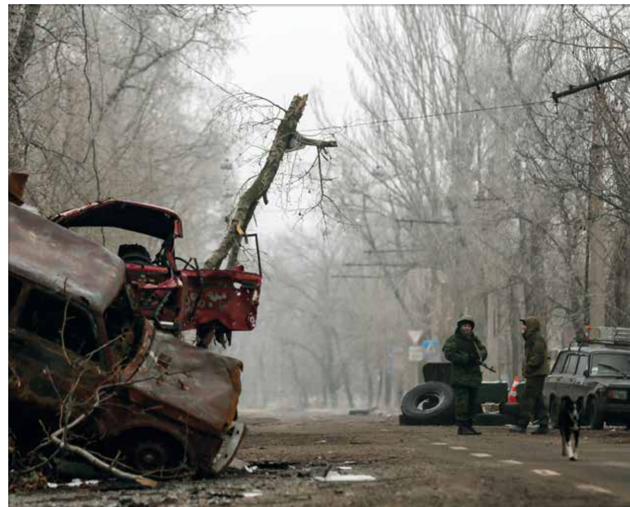
Pro-Russian separatists stand guard next to cars damaged during fighting between pro-Russian rebels and Ukrainian government forces near Donetsk Sergey Prokofiev International Airport, eastern Ukraine, December 2014.

In an effort to prevent further polarization and defuse divisions within Ukrainian society, HD also engaged in a series of local dialogue initiatives with civil society representatives in twelve regions of the country. Having analysed the conflict together, the civil society representatives agreed to form a network of facilitators who could run dialogue processes designed to address tensions between pro-Maidan and anti-Maidan groups, local people and internally displaced people, as well as between the population and local government. In November and December 2014, HD convened two strategy workshops – the first in Kyiv and the second in Odessa – to help the network representatives convert their analysis into relevant dialogue processes for each region.