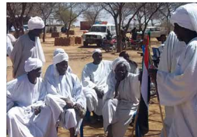
Mediation and reconciliation initiative between the Salamat and Misseriya tribes carried out by the Central Darfur Nomad Network, with the support of HD, May 2014.

To explore solutions, HD brought together senior officials from Myanmar and four of its neighbours in the region – Bangladesh, Malaysia, Thailand and Indonesia – for a series of regional dialogues. HD also brought a high-level delegation from Myanmar, including the Minister of Immigration, to Geneva for talks with a number of diplomatic Missions and