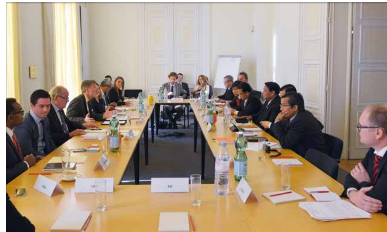
As part of efforts to address communal tensions and renewed violence between the Muslim minority and the Buddhist majority in Myanmar's Rakhine State, HD brought a high-level delegation from Myanmar to Geneva for talks with a number of diplomatic Missions and international relief agencies. Talks focused on developments in Rakhine State and resulted in agreement on the need to balance humanitarian and development aid, open access to relief aid, and relocate displaced populations.

HD also contributed to regional discussions supporting the establishment of an ASEAN Institute