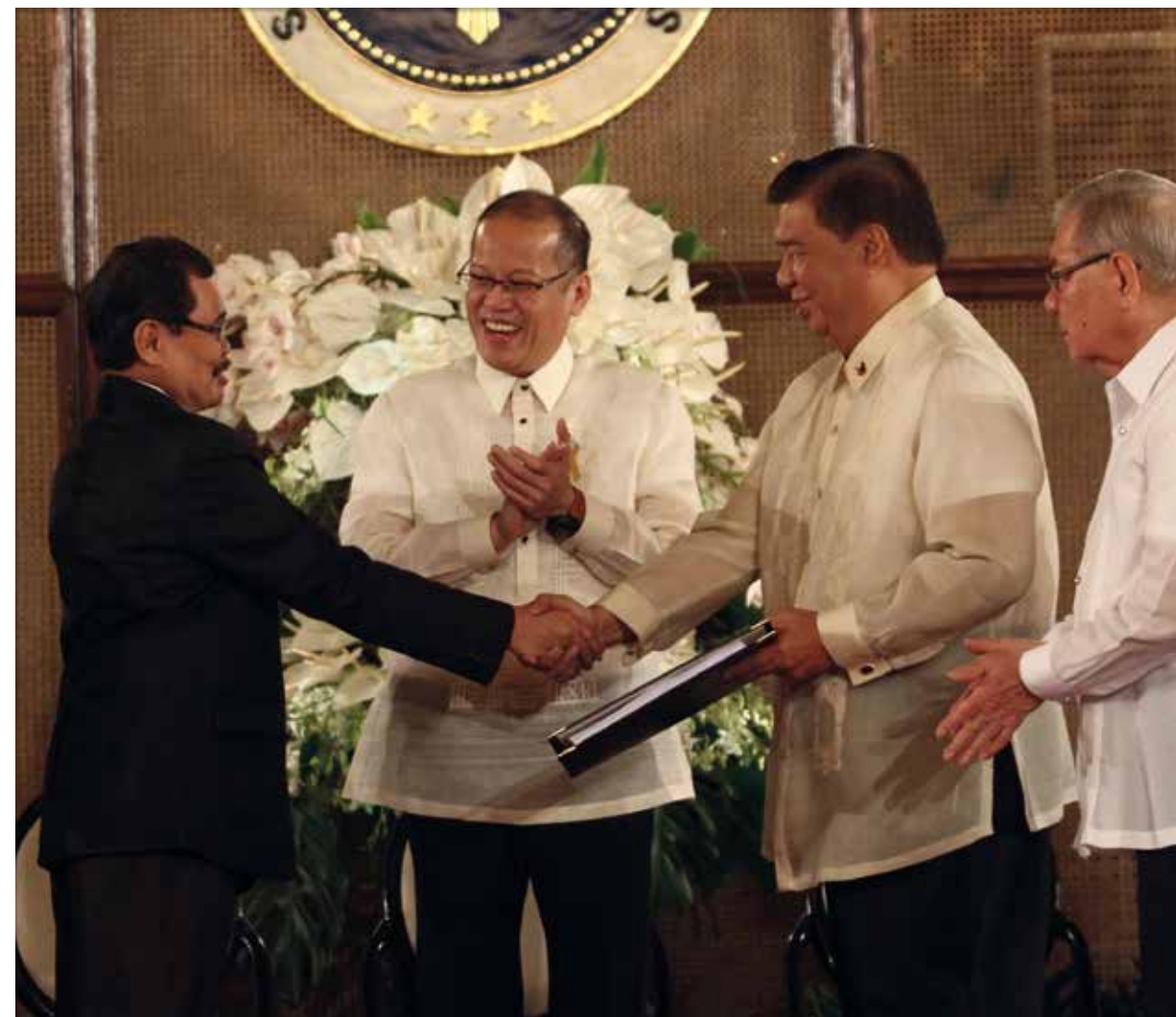
Philippines President Aquino III witnesses the handover of the draft Bangsamoro Basic Law (BBL) by Bangsamoro Transition Commission Chairman, Mohagher Iqbal, to Speaker of the House, Feliciano Belmonte Jr, and Senate President, Franklin Drilon, September 2014.

In Myanmar, HD's country programme focused on advising and supporting efforts by the Government and more than a dozen ethnic armed groups to reach a Nationwide Ceasefire Accord, and helping to prepare them for the political dialogue which is expected to follow. HD shared best practice on negotiating a 'framework for political dialogue' not only with the Government and ethnic armed groups but also with the Myanmar military and political parties such as the National League for Democracy, reaching the wide spectrum of stakeholders who are expected to take part in the negotiations. To help ensure that such negotiations take place in a conducive environment, HD provided technical assistance on ceasefire monitoring systems which would help to reduce levels of violence in the most challenging parts of the country. Both Government and