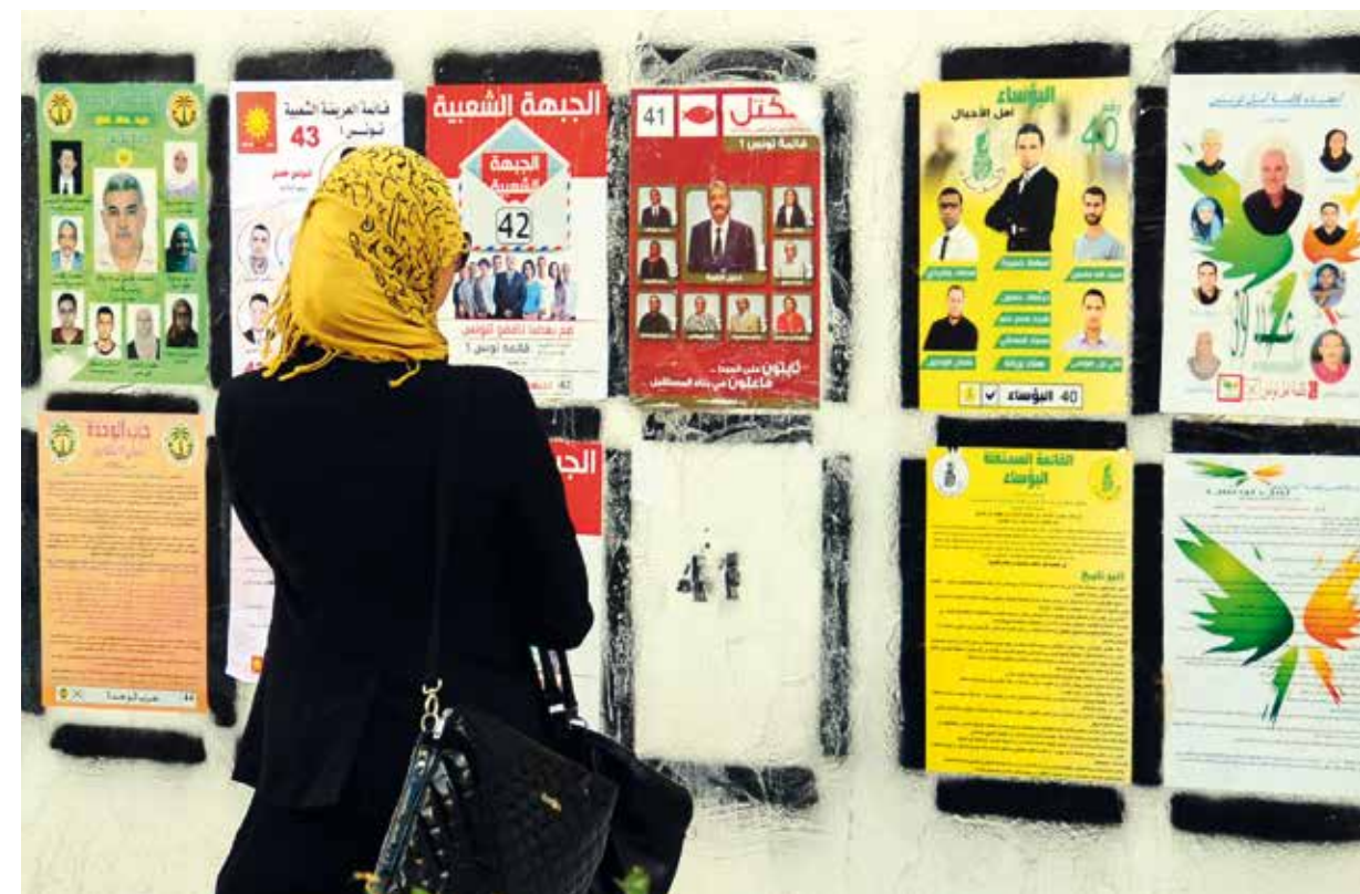
A woman looks at electoral campaign posters for the upcoming parliamentary elections in Tunis, Tunisia, October 2014.

The dialogue rounds were preceded, and followed, by bilateral meetings between HD and political party representatives to explore the grounds for possible compromise. After it was signed, HD organised follow-up meetings to reduce lingering tensions and worked to promote public understanding and support for the Charter (for more on this process, see the 'Tunisia: Paving the way to peaceful elections' section). The impact of the Charter was apparent in the orderly conduct of legislative elections in October and the peaceful transfer of power that followed Presidential elections in December.