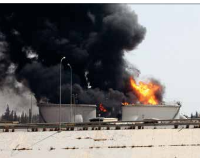
A fuel depot on fire near Tripoli airport, after being hit by a rocket, July 2014.

In 2014, HD was also active in helping humanitarian agencies and donors to identify needs and to establish contacts with local Syrian organisations that could help with the delivery of aid. In addition to supporting local mediation initiatives, HD facilitated twelve projects – mainly in agriculture, education, infrastructure, civil defence and psycho-social support – and, although the rise of IS and air strikes against them prevented full implementation of some projects, HD provided guidance to donors on aid initiatives, particularly affecting IS-controlled areas.