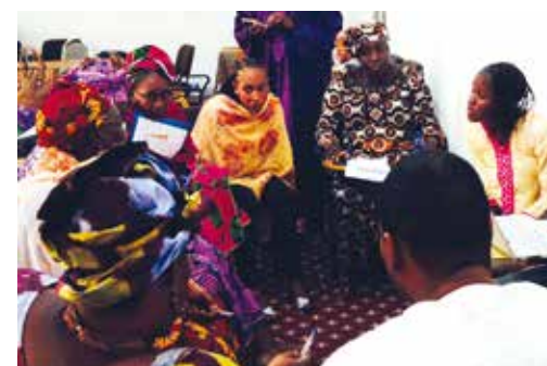
Workshop on the inclusion of women and youth in the peace process in Mali, Bamako, July 2014.

In addition to its practical engagement in operations, the organisation is keen to draw lessons from its experiences and to share them both within the organisation and beyond. In 2014, HD contributed to the discussion on inclusion which took place within the Mediation Support Network and published a new issue in its Mediation Practice Series presenting several approaches through which mediators can involve more stakeholders, including women, in peacemaking efforts.