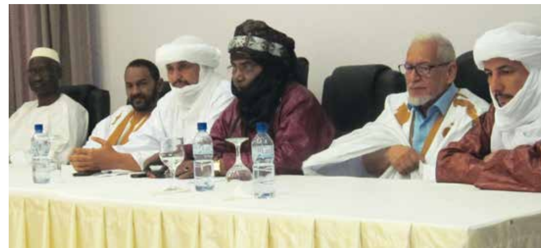
Northern Mali armed opposition groups met in Burkina Faso in August 2014 to harmonize their negotiating positions in the Algiers talks and to agree on a cessation of hostilities. The meeting was moderated by HD.

As part of the 11 agreements which HD helped to bring to fruition in 2014, the organisation supported the conclusion of a peace accord between the Government of the Republic of South Sudan and the South Sudan Democratic Movement/Army Cobra Faction. This was mediated by the Church Leaders Mediation Initiative (CLMI) which was undertaken by three Bishops and a national figure well-known for his independence. The CLMI lacked a formal structure or operational staff and HD, in addition to contributing extensive background experience and knowledge of the principals, provided technical support, convened meetings, brought experts to roundtable discussions with the parties, assessed developments and possibilities, and supported the implementation of the peace accord.