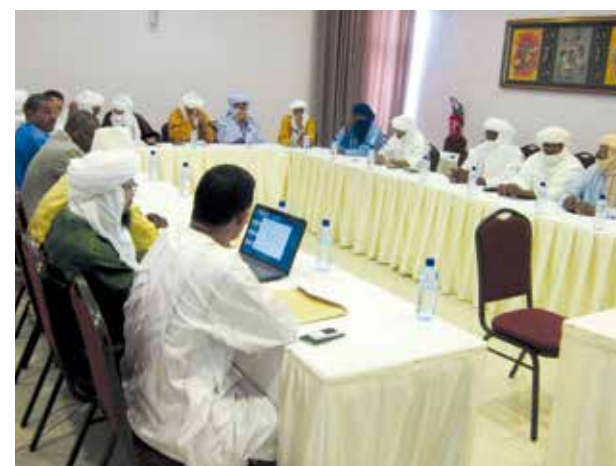
Meeting of six Northern Mali opposition groups in Burkina Faso in August 2014, during which they agreed on an immediate cessation of hostilities and on harmonising their negotiating positions in the national peace process. Both agreements were merged into a common 'Ouagadougou Declaration'.

These two agreements were then merged into a common Ouagadougou Declaration which put a short term brake on the rivalries that had hampered the progress of the Algiers peace process. The Declaration did not eliminate conflict in a region of deep-rooted rivalries and the situation deteriorated further towards the end of the year. However, it marked an essential step in creating conducive conditions for a broader peace with the Government in Bamako and showed that it was possible to unite the armed groups around a common position to alleviate the suffering of the civilian populations on the ground.