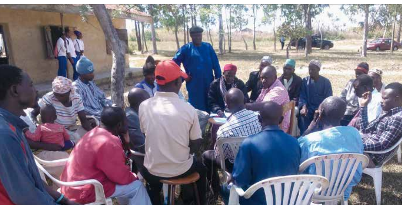
Focus group discussion between the Berom and Fulani communities in Barkin Ladi Local Government Area, as part of the Jos inter-communal dialogue process facilitated by HD, November 2014.

to Kenya's national election, HD adopted a similar approach in Mozambique in 2014, helping the country's National Electoral Commission to set up violence prevention panels. The initiative is part of the organisation's wider engagement in Mozambique, which will continue in 2015, providing support to national mediators – including the Religious Network for Reconciliation and Peace which undertakes conflict resolution and reconciliation work at the grassroots level.