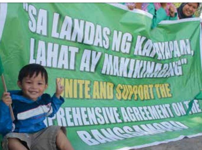
Bangsamoro women and children joined thousands who gathered in General Santos City to show their support to the signing of the Comprehensive Agreement on the Bangsamoro (CAB), March 2014.

Much of HD's work remains low-key but, in this instance, with political parties embracing the Charter, HD sought as much visibility for the Charter as possible to raise public awareness of its principles of resisting violence and preserving freedom of expression, and to cement the commitment of politicians.