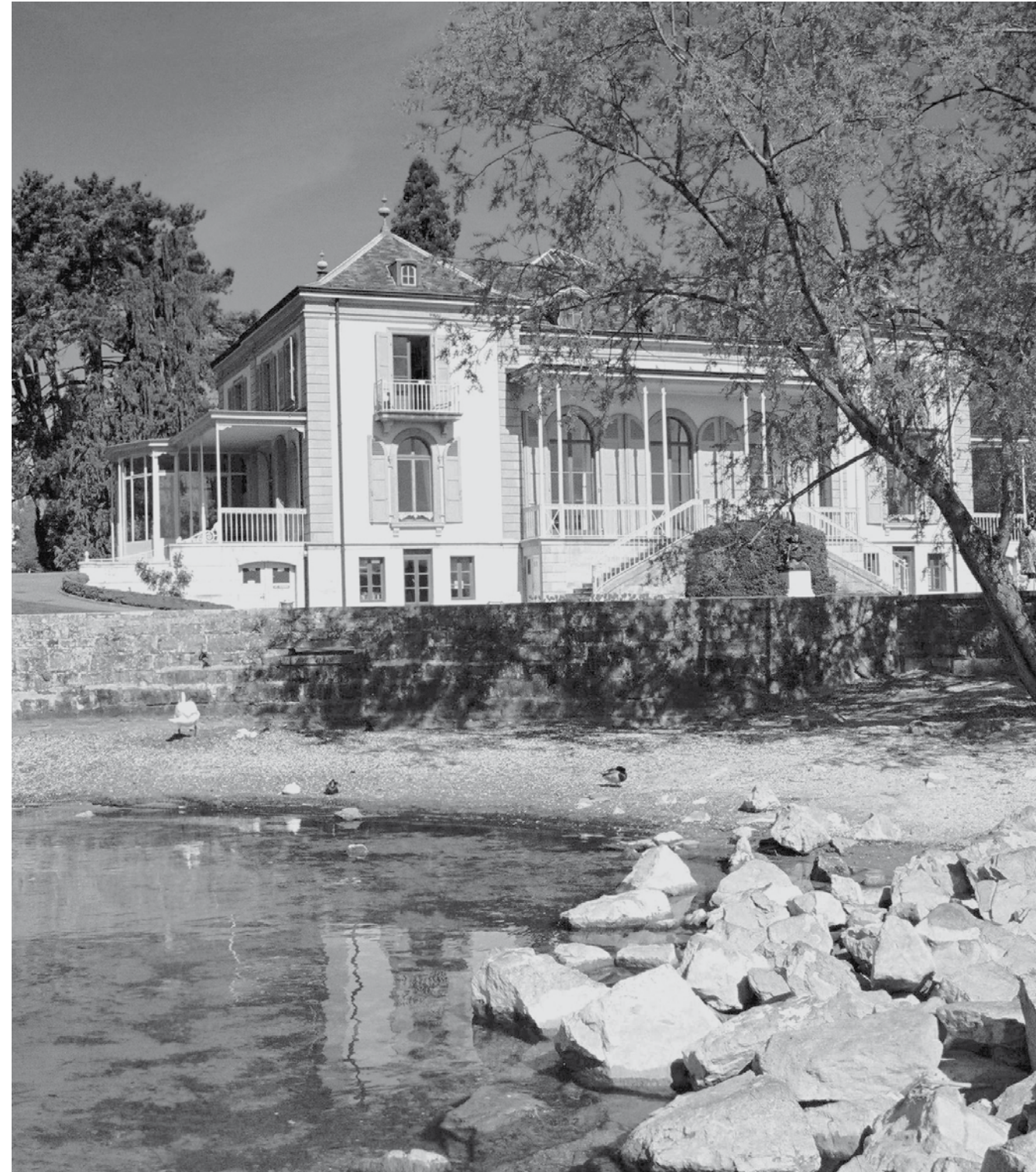
The Villa Plantamour, HD's head office.

Since 2010, HD has been honoured to have Dr Javier Solana as its Honorary President. Dr Solana is the former Secretary-General of the Council of the European Union and former High Representative for the Common Foreign and Security Policy (1999 to 2009). He was Secretary General of the North Atlantic Treaty Organisation (NATO) from 1995 to 1999, and Spain's Minister for Foreign Affairs from 1992 to 1995. Dr Solana is currently President of the ESADE Center for Global Economy and Geopolitics, Distinguished Fellow in Foreign Policy at the Brookings Institution, and a member of the Boards of the International Crisis Group, the European Council on Foreign Relations, and Human Rights Watch.