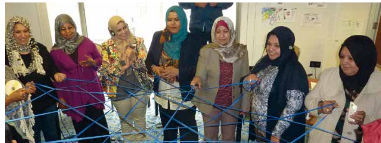
Workshop on gender and conflict analysis in Libya with women across regional and ideological lines, February 2015.

In Libya, HD's team worked closely in 2014 with women across regional and ideological lines to prepare a workshop on gender and conflict analysis. Due to the rapidly deteriorating security situation, this workshop was postponed until February 2015. Despite the grave security challenges, Libyan women were determined to meet and discuss frankly the roots of the conflict and how they can