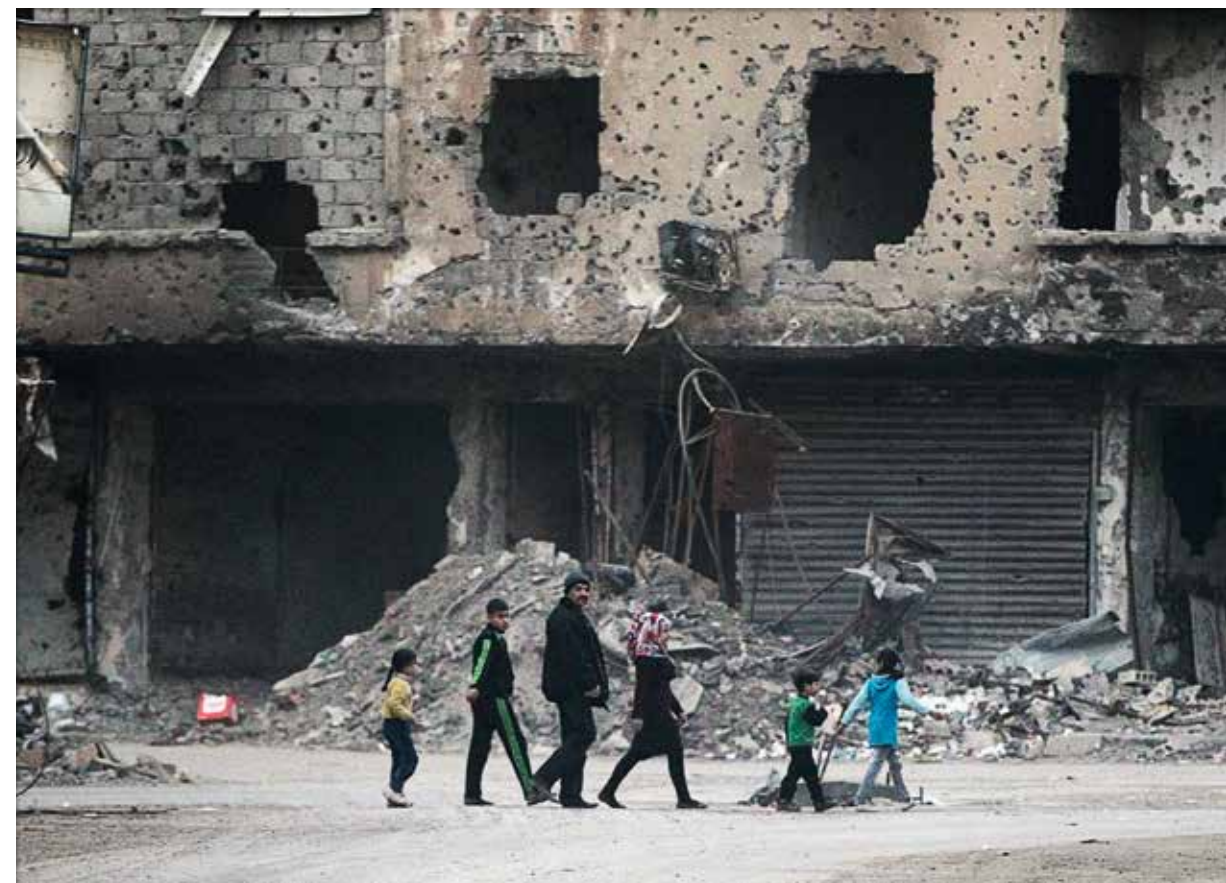
A family walks along a damaged street in Deir al-Zor, eastern Syria, 7 February 2014.