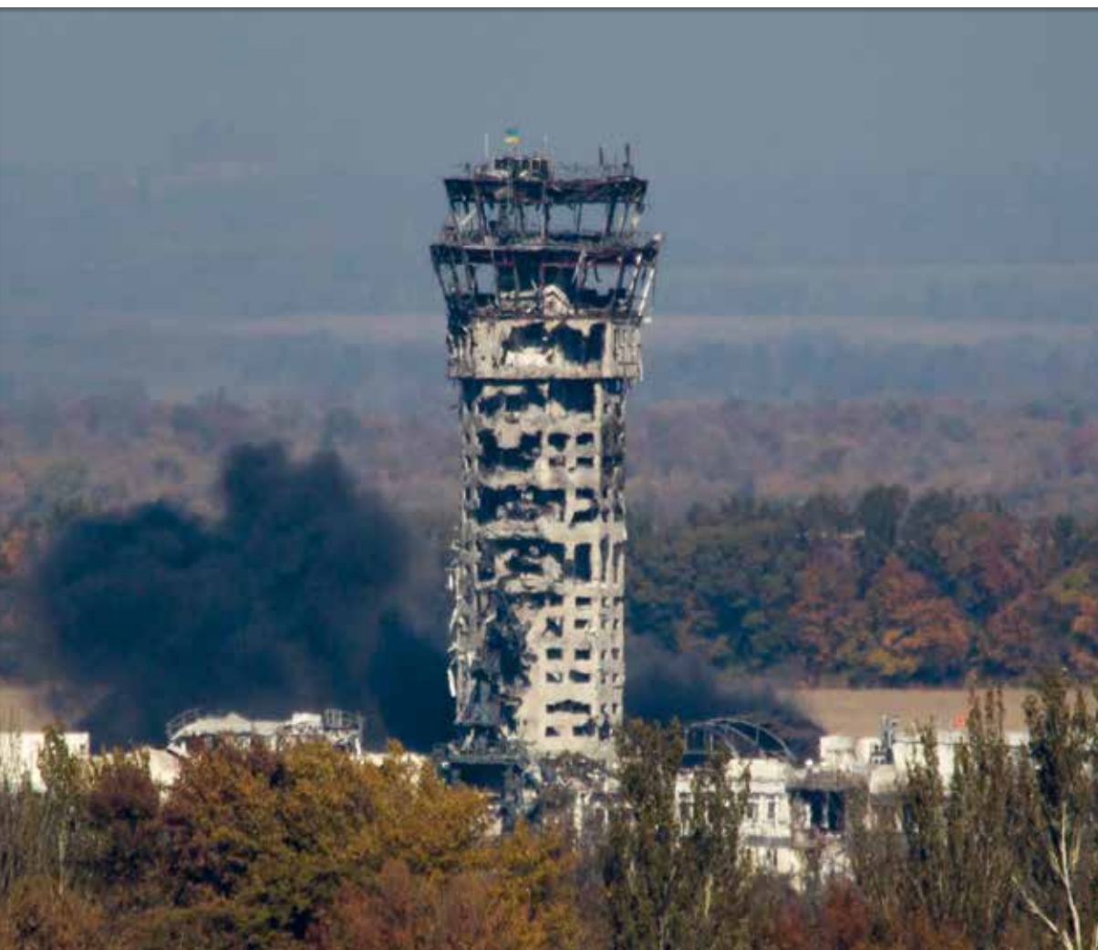
A Ukrainian national flag flies at top of a badly damaged traffic control tower as smoke rises after shelling at the Donetsk Sergey Prokofiev International Airport in Donetsk, eastern Ukraine, October 2014.

situation. In August, these discussions resulted in a Declaration on the Protection of Civilians which was signed by the DNR, LNR and many of the battalions aligned with Kyiv (for more detail on the Declaration, see the section on 'Ukraine: Opening channels for humanitarian aid'). Through this process, HD was able to open a channel for communication between local authorities in the Donbas region and humanitarian agencies.