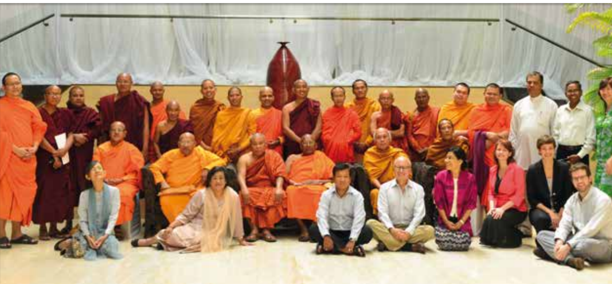
Buddhist monks and lay people from Theravada Buddhist countries in Asia met for two days in Bangkok to discuss the challenges of promoting peace and maintaining communal harmony in their respective countries. The meeting was convened by HD.

The situation in Rakhine State contributed to wider regional concerns about tensions between Buddhists and Muslims across parts of South and Southeast Asia. Maintaining traditions of religious tolerance and preventing religious identity from being exploited for political purposes are becoming key areas of conflict mitigation in Asia. To help strengthen the moderate base and to help Buddhists manage conflicts in their communities, HD convened a regional network of senior Buddhist monks from Cambodia, Myanmar, Thailand, Laos and Sri Lanka. The outcome so far has been the framing of an action plan that aims to provide Buddhist monks with a platform to disseminate the values of peace and also, in a more concrete way, to develop the tools for dialogue and mediation.